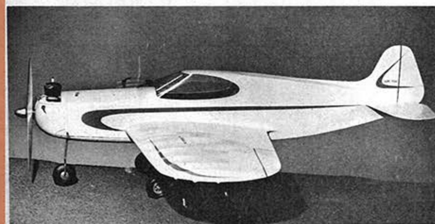
As landplane, craft looks like Goodyear racer. Does all loops, and horizontal eights.