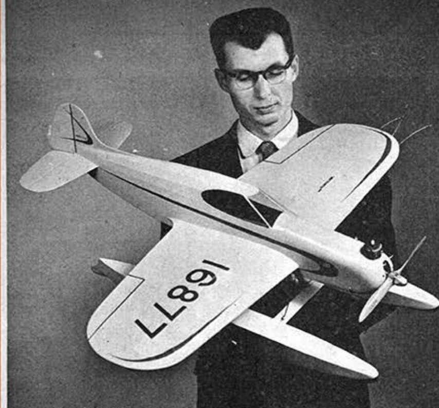
As seaplane, ship gets on step, rises like real crate. Amazing sight is inverted flight.

For land or water this is the sport plane to end all sport planes! The J. Roberts Flight Control System makes Sure Fun dream to fly.