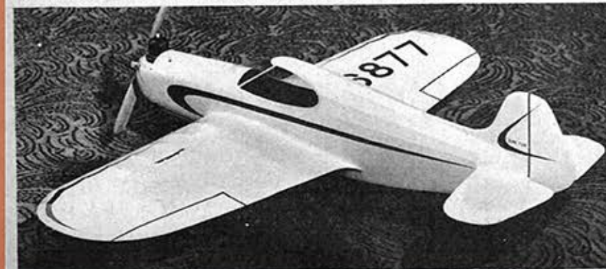
Third line—as rigged here—operates sliding exhaust throttle for an excellent low speed.

► This sport model is controlled by the J. Roberts Flight Control System which gives you complete control over your engine speed at finger-tip command. You can fly at any speed you want, yet the control response is instant with no lag.