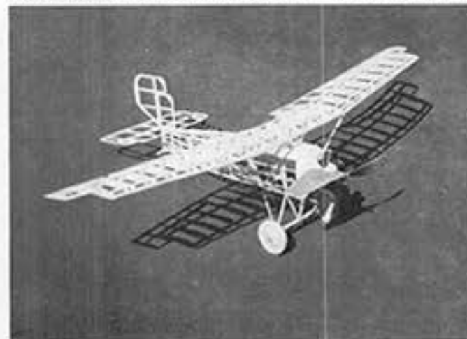
The beautifully-framed Samolot is reminiscent of the Fokker D VIII, although the DKD has proportionally larger tail surfaces.