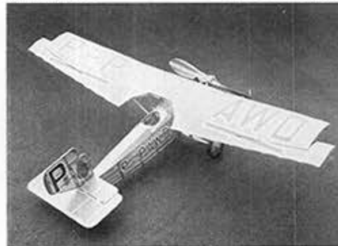
The P-PAWD should be finished in dark green covering, very appropriate for its registration letters. Control surfaces are built separately.